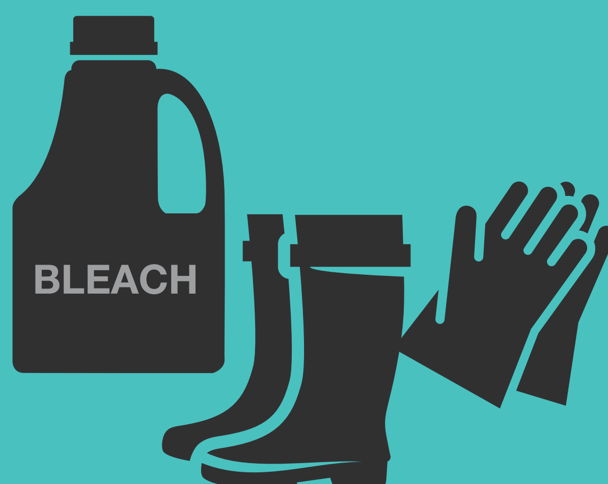
SAFE BURIAL PRACTICES