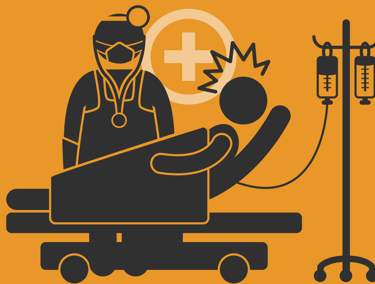
PATIENT INTERVIEW FOR CONTACTS