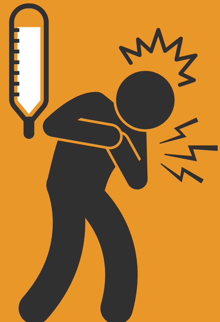
ANY NEW PATIENT RESTARTS PROCESS